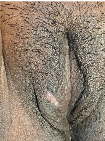
Figure 4. Three weeks after cautery excision.

Cautery excision under local anesthesia was performed to remove the mass. We used a povidone-iodine solution and 70% alcohol to disinfect the lesion and the surrounding area. The lesion was anesthetized by injecting 2% lidocaine hydrochloride into the base of the pedicle. The pedicle was clamped with forceps at its base and then cut with electrocautery parallel to the skin surface (Figure 2). Electrodesiccation and pressure dressing were used to stop the bleeding.