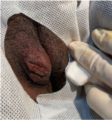
Figure 2. Immediate after cautery excision.