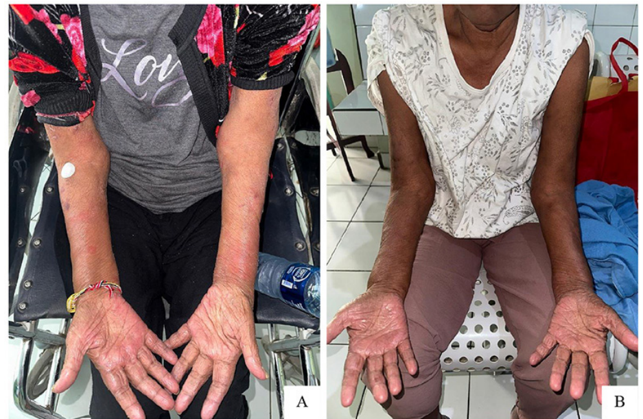
Figure 2. Clinical presentation: 4 months post-MDT re-initiation (A), and after 2 months of antimicrobial-resistant treatment (B).